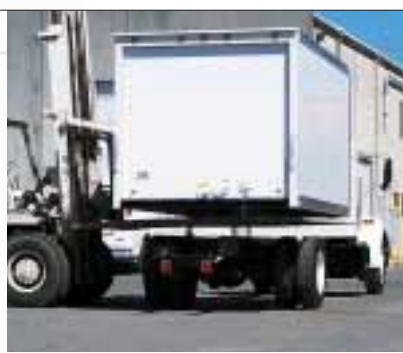
Your body builder will be pleased. With clear frame space reserved for body equipment, and many body builder features including a weather-tight pigtail to simplify final wiring assembly, he's set to do his best work – quickly and efficiently.