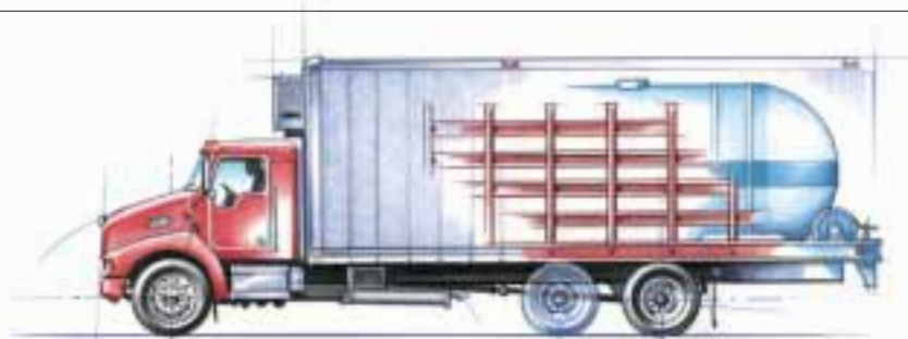
Kenworth's do-anything medium duty conventional is available in a straight truck or tractor, with single or tandem axles in GVWs up to 54,600 pounds, with air & 33,000 pounds for hydraulic brake systems.

N othing says you've "arrived" more clearly than a T300 with your name on the door. It's the quality choice in a medium-duty conventional, and it shows. • No matter what your business, the versatile T300 is a great match. Available as a straight truck or tractor in a variety of wheelbases, with single or tandem axles, up to GVWs of 54,600 pounds, it's ideal for hub and spoke, stop and go, pickup and delivery operations. • A quality-built Kenworth through and through, the T300 incorporates state-of-the-art engine options for maximum power with excellent fuel economy and longevity. A wide range of axle and suspension capacities optimized to your loads and your roads. And many different manual and automatic transmission choices for just the right gearing no matter how long your driver has spent behind the wheel of a truck. All from major North American component manufacturers you know you can trust: Allison, Caterpillar, Cummins, Dana Spicer, Eaton, and Meritor. • One more thing: Kenworth delivers a body-ready chassis, making it easier for your body builder to do their best work –quickly and efficiently.