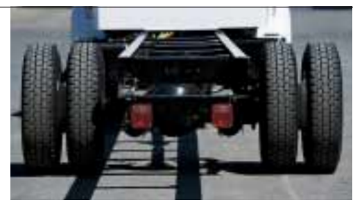
The T300's heat treated frame, available up to 120,000 psi., offers a clean top flange from back-of-cab to end-of-frame. Nothing to get in the way of an efficient body installation.